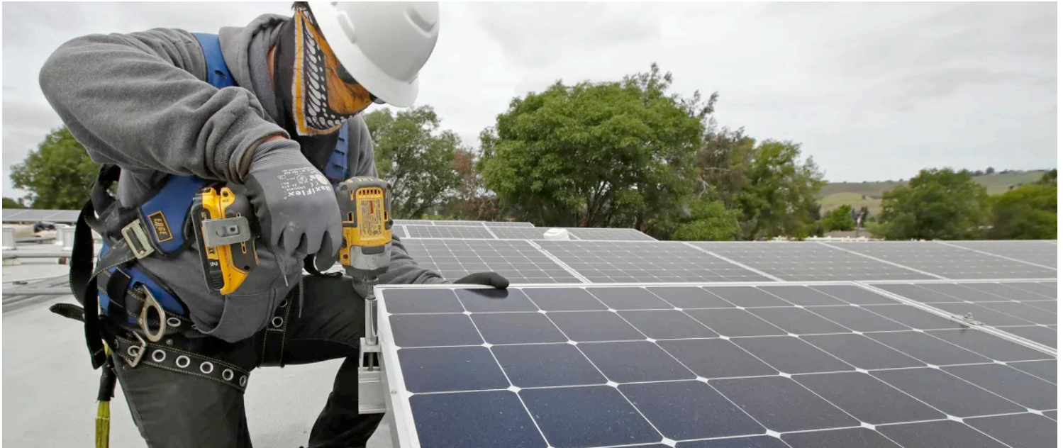
A worker installs solar panels in Hayward on April 29, 2020.

[ Article originally appeared on www.calmatters.org ]